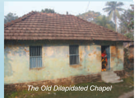
The Old Dilapidated Chapel

It was indeed a day when everyone was filled with the grace of the Lord and astounded beyond measure, saying, "He has done everything well" - Mark 7:37.